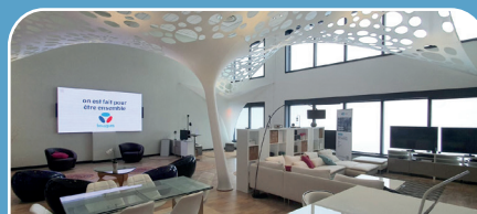
INNOLAB BY BOUYGUES TELECOM ENTREPRISES

Demonstrators in the field of Manufacturing and Process industries Automation & Industrial IoT technologies