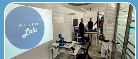
ALTEN LABS BY ALTEN

5G Demonstrators for the Enterprise Telecom & 5G Technologies