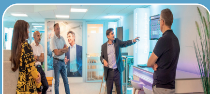
DEC INNOVATION CENTER BY SIEMENS

Three showrooms to support our customers in the digital transformation of their industry through 5G innovations and their use cases